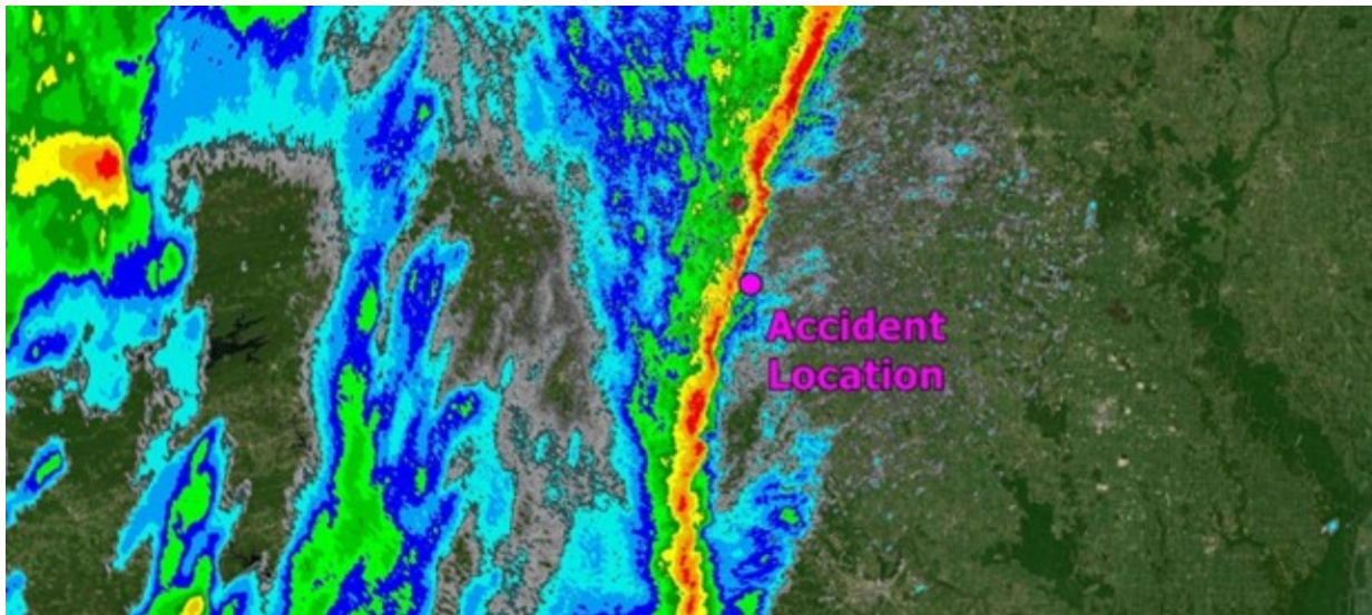
Figure 2. Weather Radar Image. The accident site is depicted by a pink dot.

Weather radar imagery identified a line of extreme-intensity precipitation approaching LIT from the west during the period before the accident. (See Figure 2.) Velocity imagery depicted the accident location along a line of radial wind shift about the accident time.